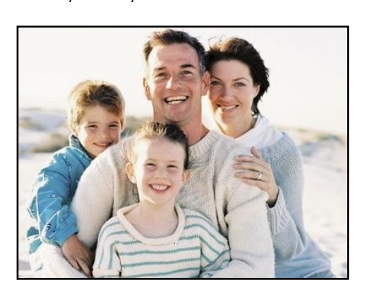
Financial Arrangements Available to Fit Your Budget

Part of your investment goes directly to a perpetual care trust fund. Only the interest and income from the fund will ever be used for care and maintenance of the park. This means, there will never be any future assessments to you or your heirs for care of the lot.